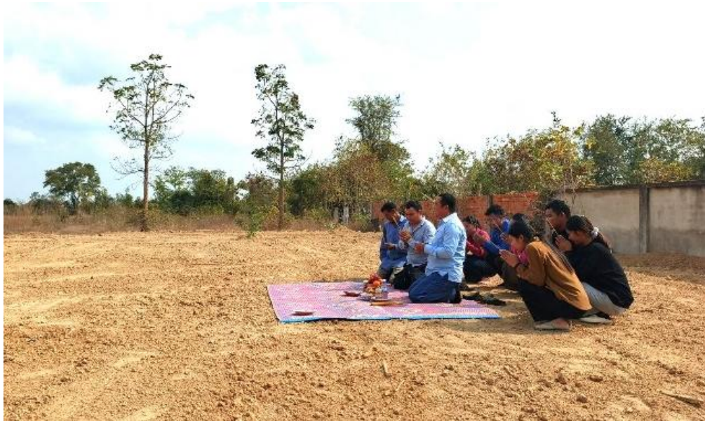
Culture believe was performed before school building started)