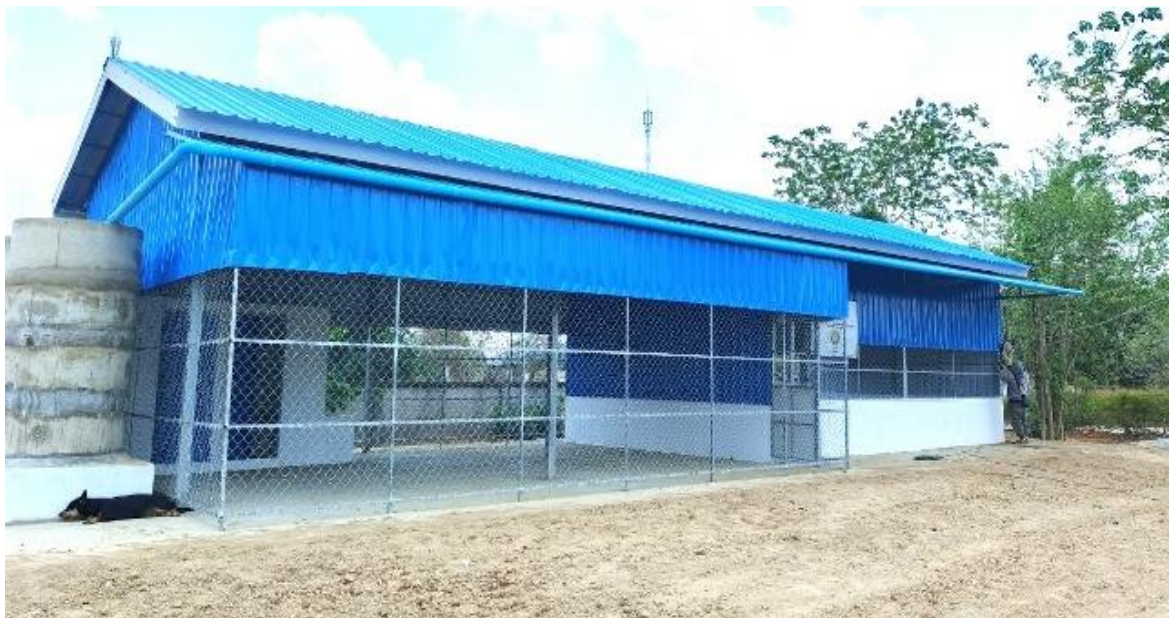
(The construction is finished)