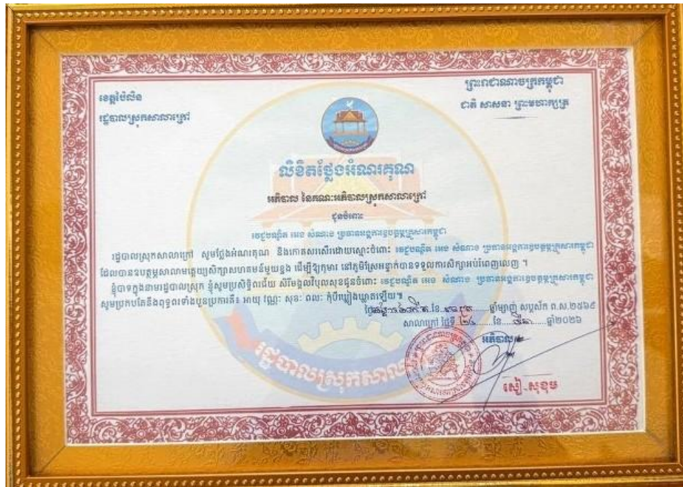
(Letter of appreciation by Government to Cambodia Family Support)