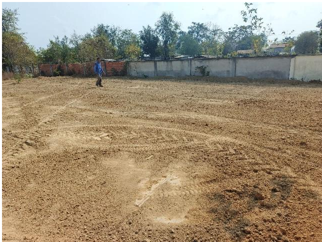
(land clearing and land filling)