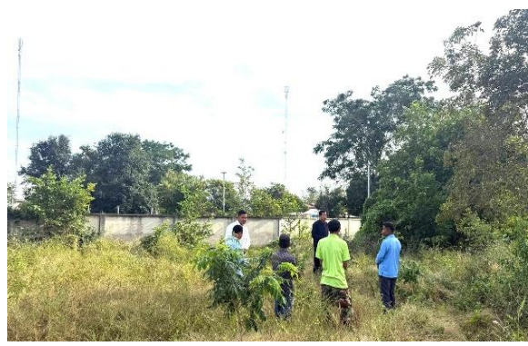
(Dr. Samnang visited building location)

As approved, the building process initially stated by land clearing and land filling to start building. Here are some pictures along the building process: